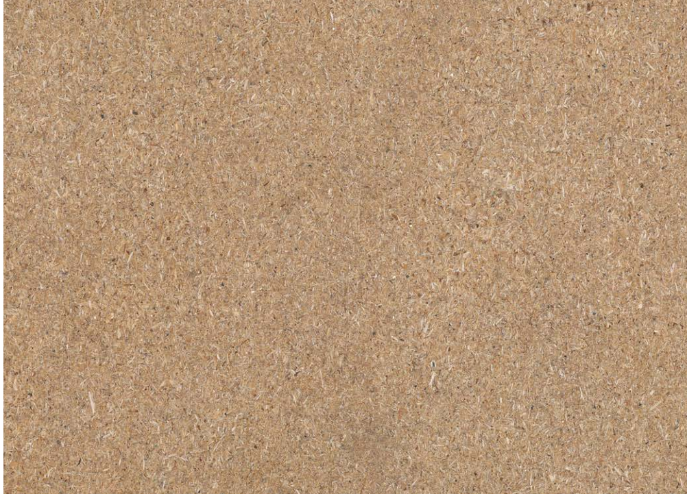
100% Recycled wood panel