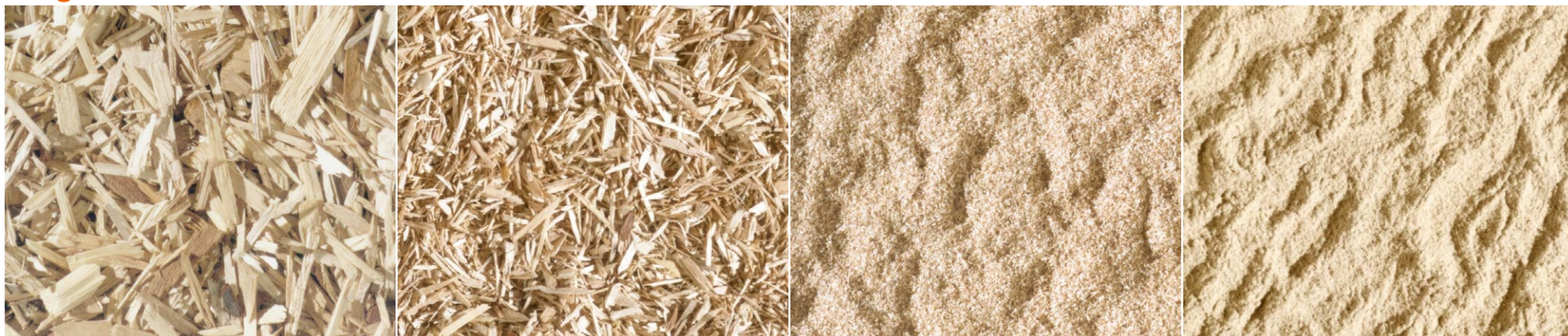
> Core big